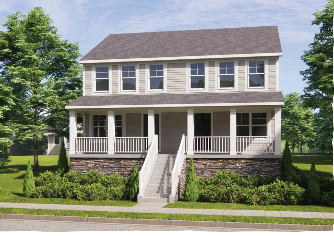
Rendering of FROM's proposed duplex.